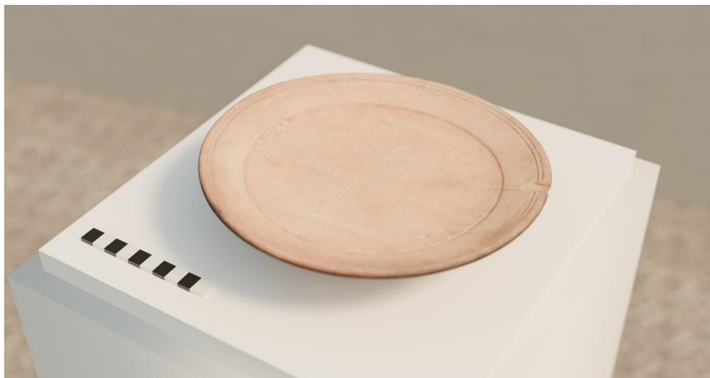
Fig. 7 – Rendered image of the final model