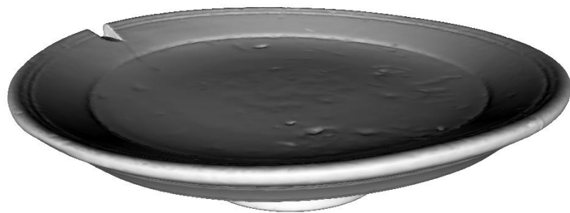
Fig. 3 – Low Poly