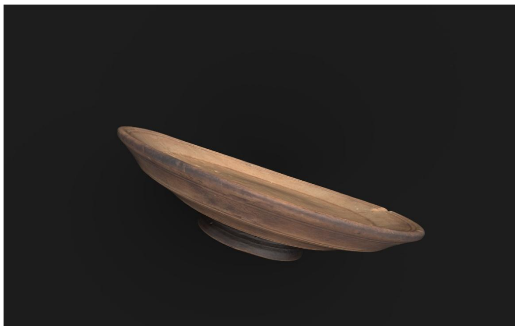
Fig. 5 – After texturing with SP