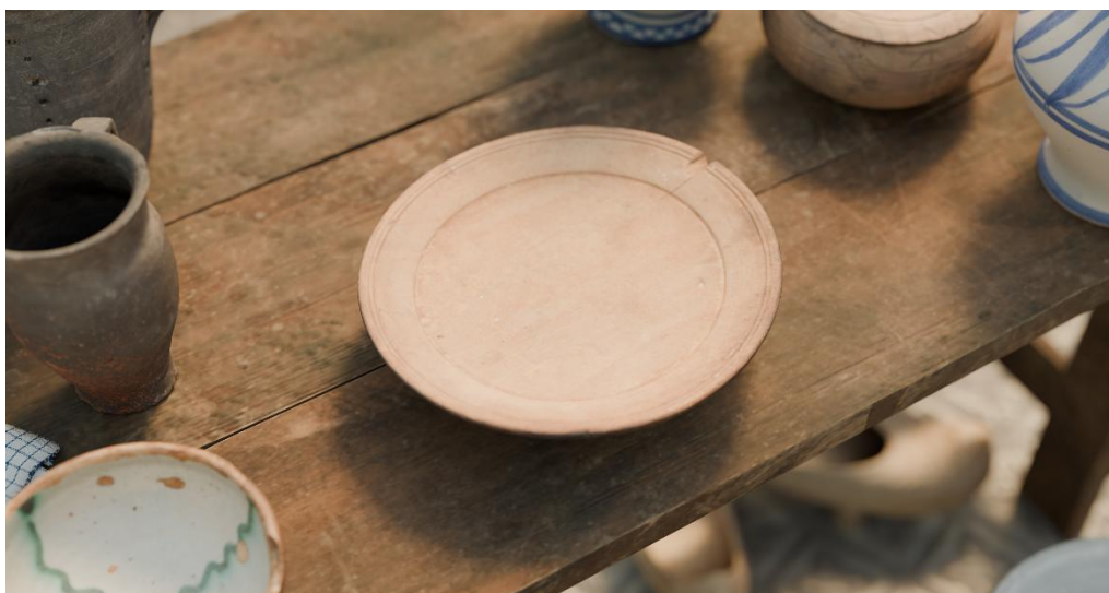
Fig. 8– Final model rendered in context