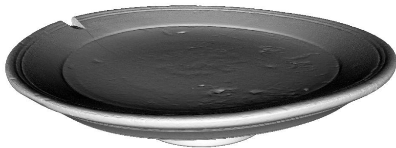
Fig. 2 – High Poly