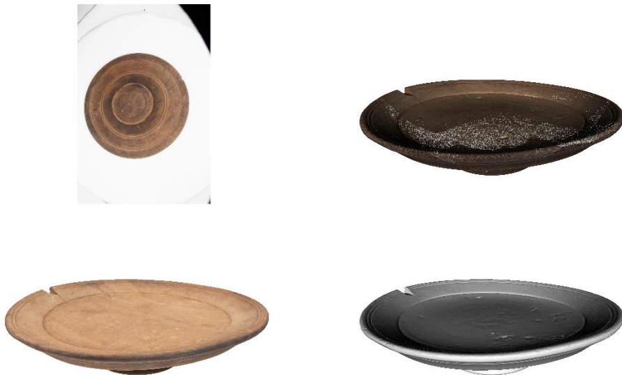
Fig. 1 – Composite 4 Views