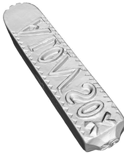
Fig. 2 – High Poly