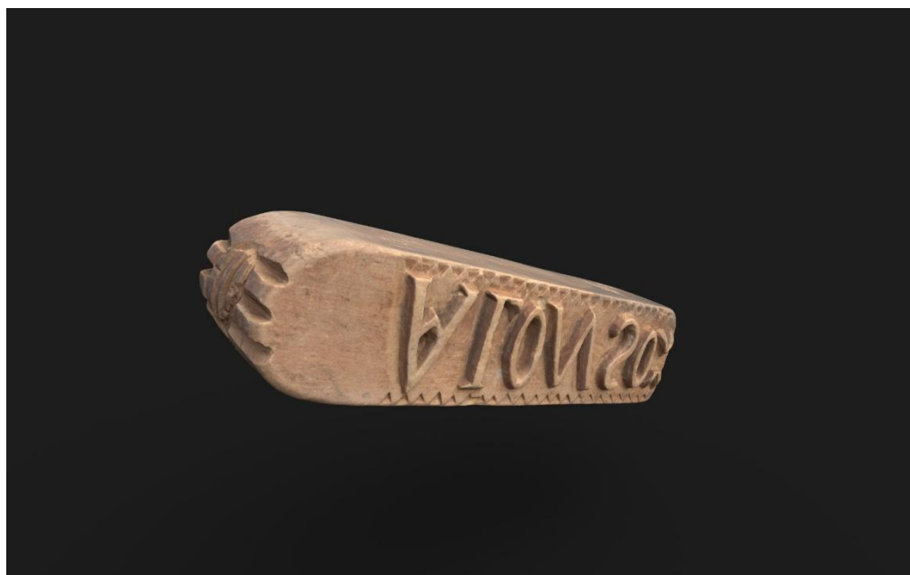
Fig. 5 – After texturing with SP