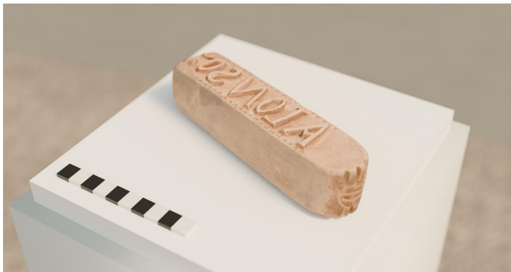
Fig. 7 – Rendered image of the final model