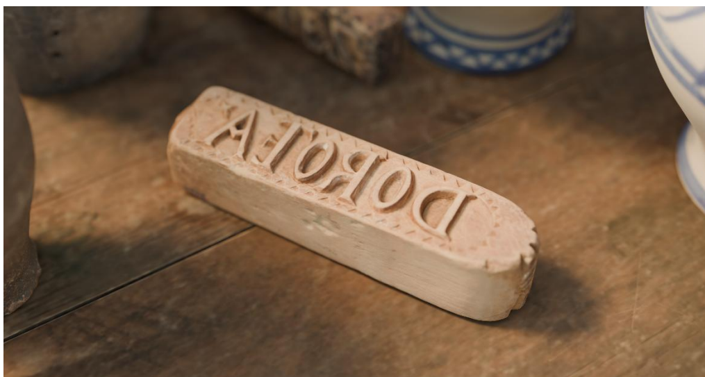
Fig. 8– Final model rendered in context