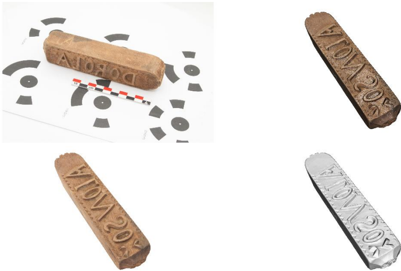
Fig. 1 – Composite 4 Views