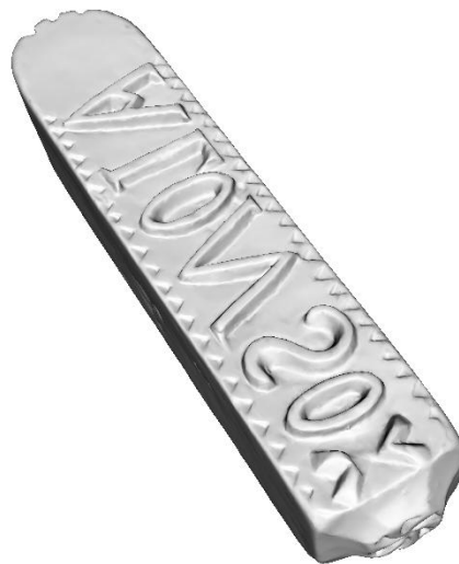
Fig. 3 – Low Poly