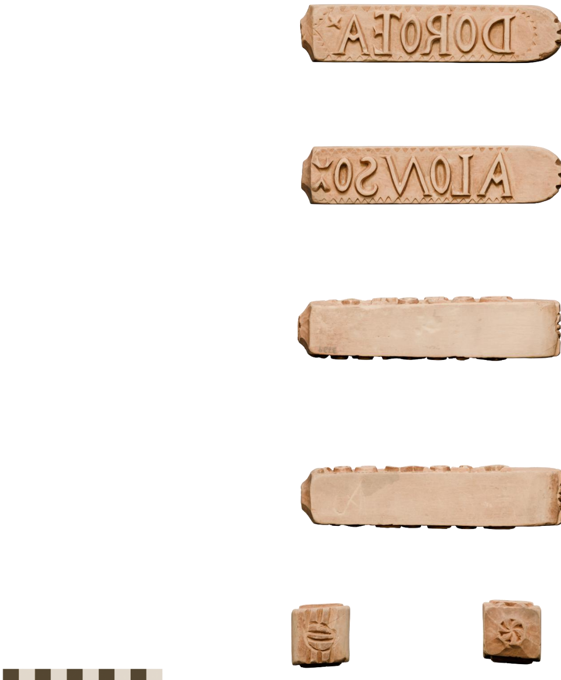
Fig.9 – Different views of the 3D model showing front, back, sides, bottom, and top perspectives