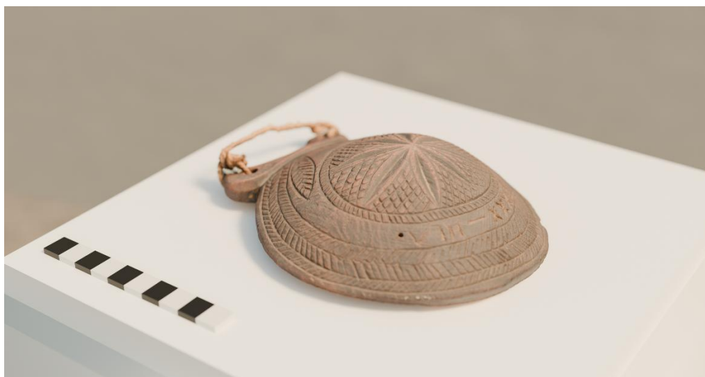
Fig. 7 – Rendered image of the final model