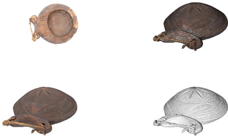
Fig. 1 – Composite 4 Views