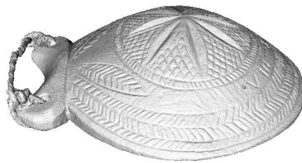
Fig. 2 – High Poly