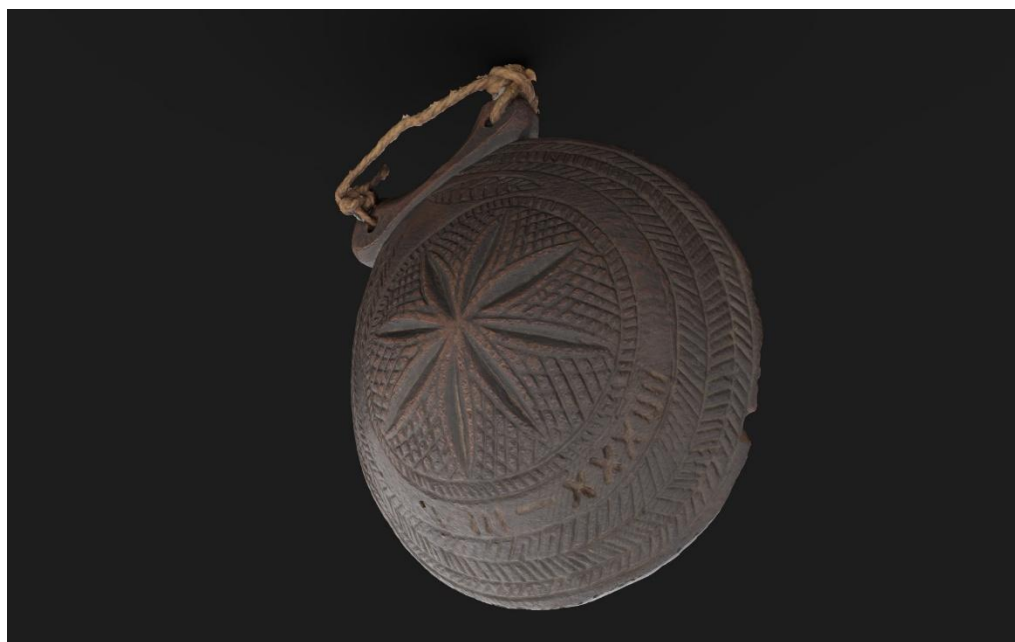
Fig. 5 – After texturing with SP