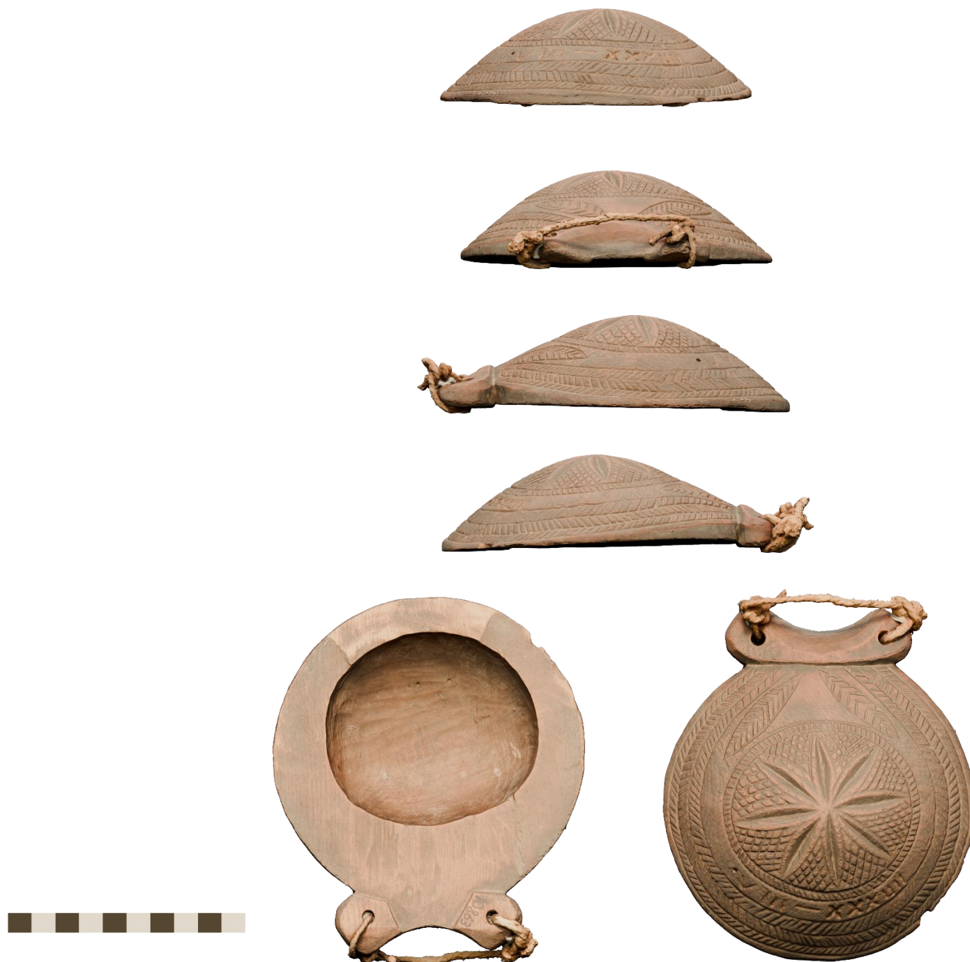
Fig.9 – Different views of the 3D model showing, front, back, sides, bottom and top perspectives