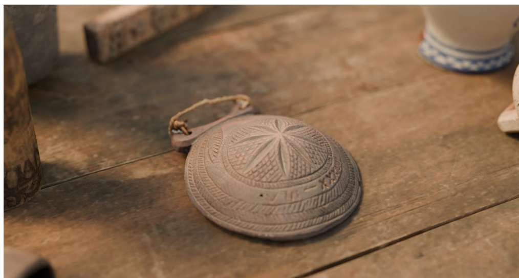
Fig. 8 – Final model rendered in context