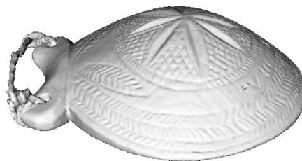
Fig. 3 – Low Poly